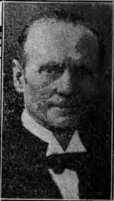
Sir Norman Angell

Angell's views on the subject were published